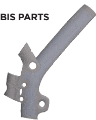
A - (1 pcs.)