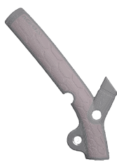
B - (1 pcs.)